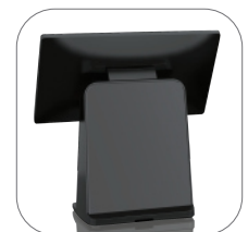
Sleek design without screws on surface