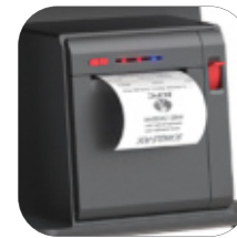
Inbuilt 80mm thermal printer, support thermal receipt & thermal sticker