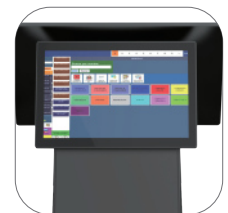
7/10.1 inch IPS second display option