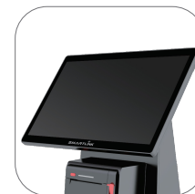
14 inch IPS with 1920*1080