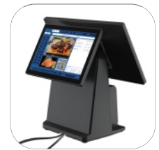
Easily hide cables in the base for a clean installation