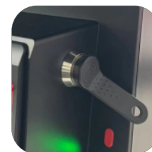
iButton® optional efficient and easy to use